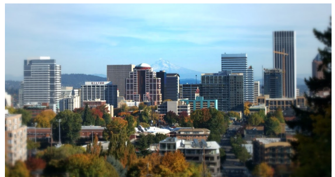
City view Portland

Portland, Oregon is widely recognized for its commitment to sustainability and progressive land use planning, which will allow for quick access to outdoor recreation and opportunities to engage with the rich cultural and historical dimensions of the Pacific Northwest landscape.