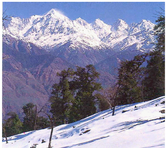
The natural scenery of the Himalayas

Whereas, the people coming from outside recognize the Himalayan scenery as a valuable resource, the natives see their land through accustomed spectacles. They somehow never attached any material value to their natural settings as far as their aesthetic aspirations were concerned. This could be because of the simple reason that it cost them nothing to derive visual pleasure from their own landscapes around them. At the most they regarded Himalayan beauty as a positive aspect of their life amidst the innumerable hardships of this terrain. Nevertheless, it needs to be researched empirically how the natives perceive the scenery in their own natural settings and whether they differ in their perception from the resource users coming from outside the region. Perceptions of the resource users from outside may be a much more varied subject.