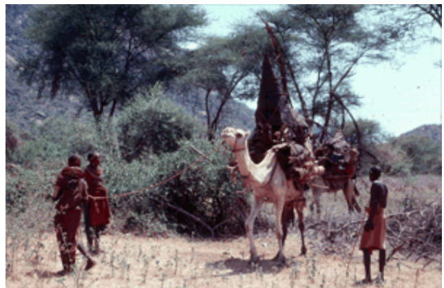
Rendille family migrating. The camel carries the family household.

with poorer range resources than those of the Booran and the Masai, but their knowledge of landscape change seemed superior to those of their counter parts. In their harsh environment human survival is dependent on detailed knowledge of landscape change. The Turkana pastoralists identify 16 landscapes patch types within an area of 5000 km 2 . They have concepts that describe different levels of grazing impact on landscapes. They distinguish between severe levels of grazing (called niirikaro to ngibaren -which means that the herbaceous vegetation is eaten so much that none is left, always in reference to livestock), heavy grazing ( toyocha ), moderate grazing ( niekudioko nginye -which means the vegetation cover is still present) and absence of grazing ( ninye dakitae ).