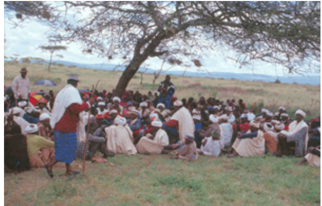
Booran pastoralists of southern Ethiopia meeting to make decisions. Picture by Gufu Oba June 1998.

identifying invasive plant species and those that are declining or those that have become extinct. I believe that misconceptions about rangeland degradation would be clarified by use of IEK research. What ecologists describe as land degradation is usually considered as temporal changes in landscape by pastoralists. Integrating IEK into landscape-applied research may, therefore, improve our understanding of landscape dynamics and help conserve grazing lands.